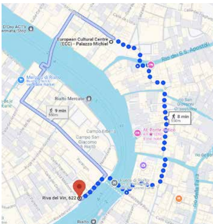
From Student Palazzo to Palazzo Michiel