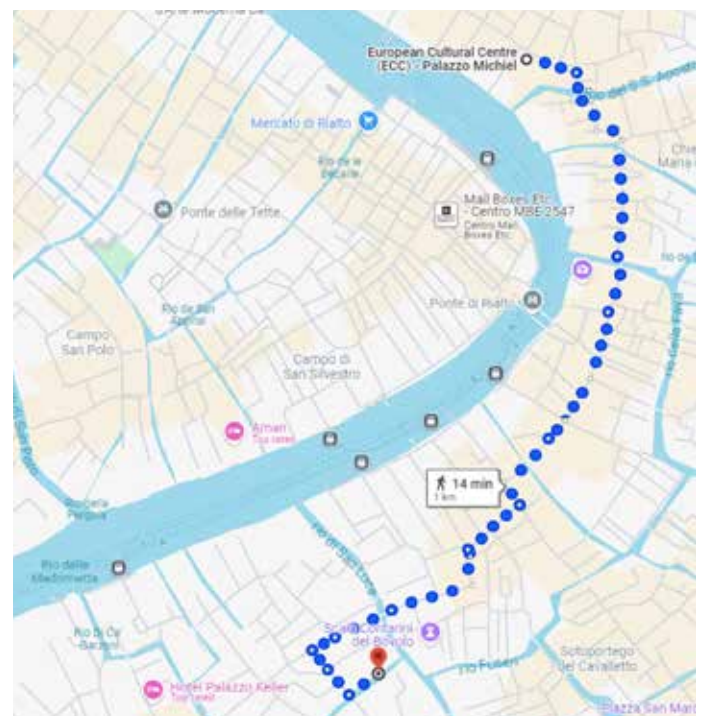
From Faculty Palazzo to Palazzo Michiel