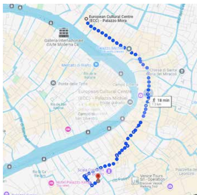
From Faculty Palazzo to Palazzo Mora